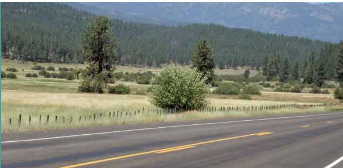
U.S. 95 near New Meadows.