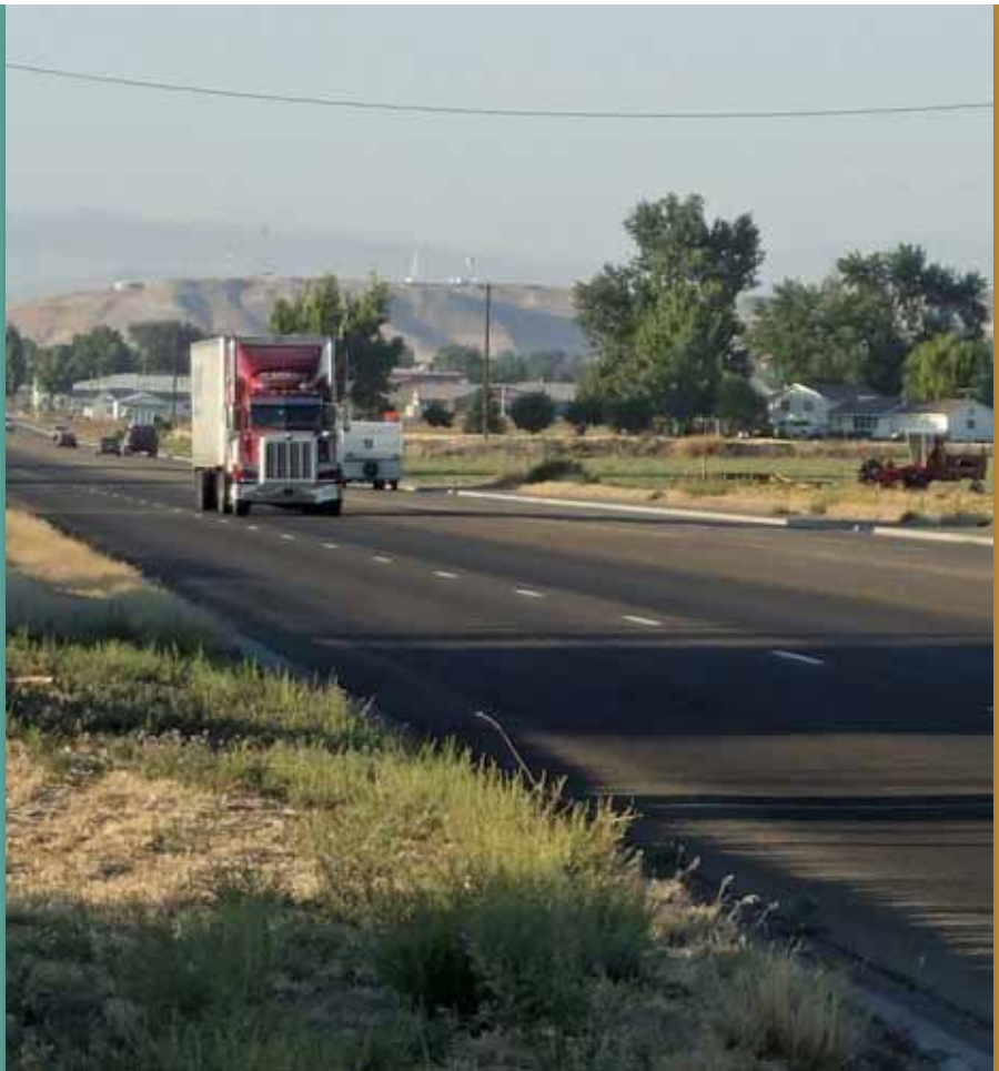
U.S. 95 near Payette.